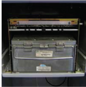
SDD (Single Denomination Dispenser)

Your ATM uses two kinds of dispensers. Check to see which kind your machine has. The only effect on balancing procedures is what you do in Step 4 of “Adding Money to the ATM”.